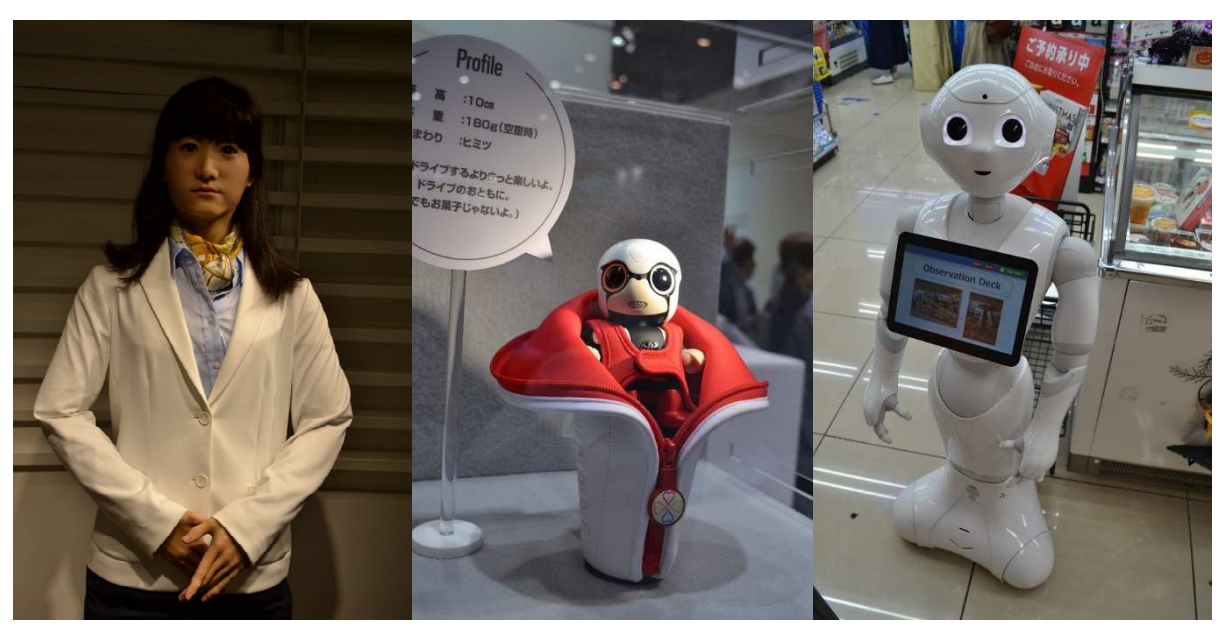
Figure 2 . From left to right: Chihira Junco by Toshiba, Kirobo Mini by Toyota, Pepper by SoftBank Robotics (formerly Aldebaran Robotics)

Three robots were selected from the sample of news articles as examples of recent robots that have received frequent press coverage: Chihira, Kirobo and Pepper (see Figure 2, below). As well as their prominence in the sample, these robots were chosen because they are robots that are still in use at the time of writing and are thus theoretically observable, allowing the author to investigate the degree to which depiction deviates from actual use.