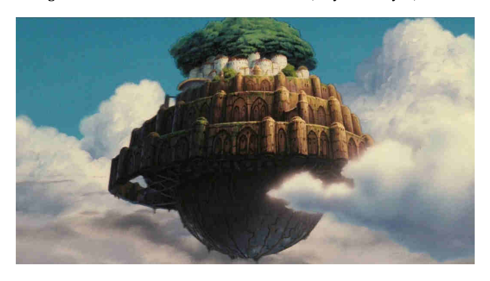
Fig. 5. Still from Castle in the Sky. © Tenkū no shiro Rapyuta, Miyazaki Hayao, 1986.