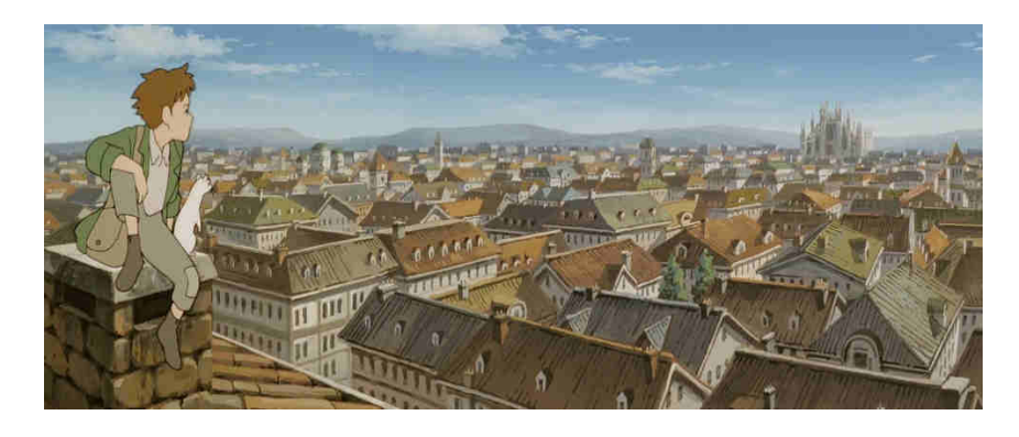
Fig. 7. Composition of stills from a panoramic shot from Romeo's Blue Skies . © Romio no aoi sora , Kusuba Kōzō , 1995 .