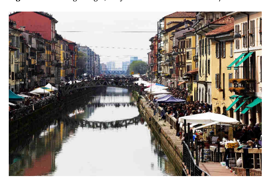
Fig. 2. Flea Market on the Naviglio Grande in Milan, Italy.