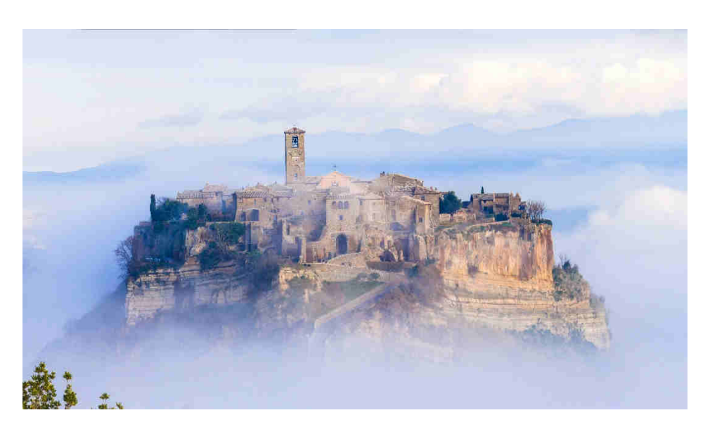
Fig. 1. Civita di Bagnoregio, Italy.