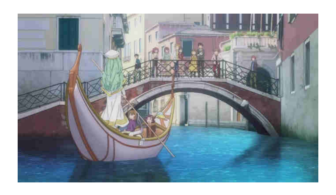
Fig. 6. Still from Aria the Crepuscolo. © Satō Jun'ichi, 2021.