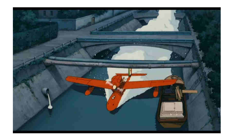
Fig. 3. Still from Porco Rosso. © Kurenai no buta, Miyazaki Hayao, 1992.